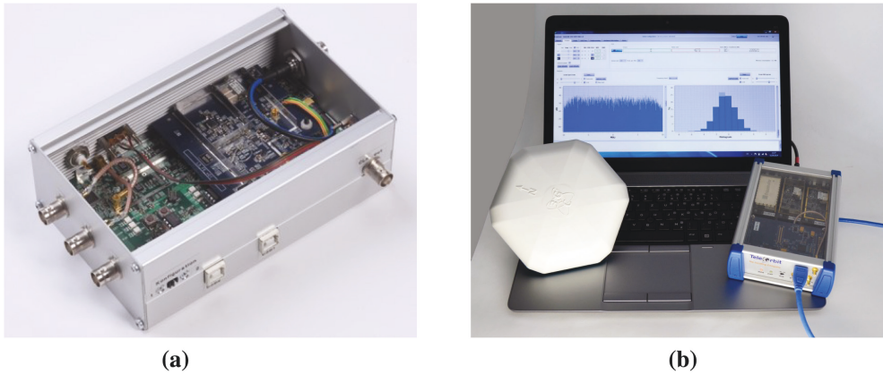
FIGURE 2 Two exemplary USB front-ends from Fraunhofer IIS (a) TriBand USB2.0 front-end from 2006 (b) Flexiband USB3.0 front-end from 2012 onwards

front-end concept. One major request was reconfigurability on the SDR front-end side. To meet these different requirements in one SDR front-end hardware component, a new version of the USB front-end was developed that realizes signal conditioning to an onboard FPGA, enabling desired reconfigurability on the fly. This feature was necessary to allow for a single-band receiver with a low sampling rate for specific real-time SDR projects, as well as a wideband and multi-frequency front-end for other projects.